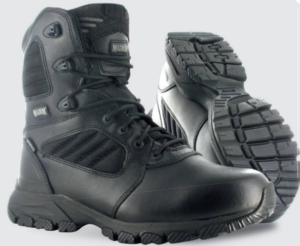
LYNX 8.0 SZ

YKK SLIP SOIL SCANNER SHOCK COMPOSITE WIDE WIDTHS SIDE ZIPPER RESISTANT SAFE ABSORPTION TOE