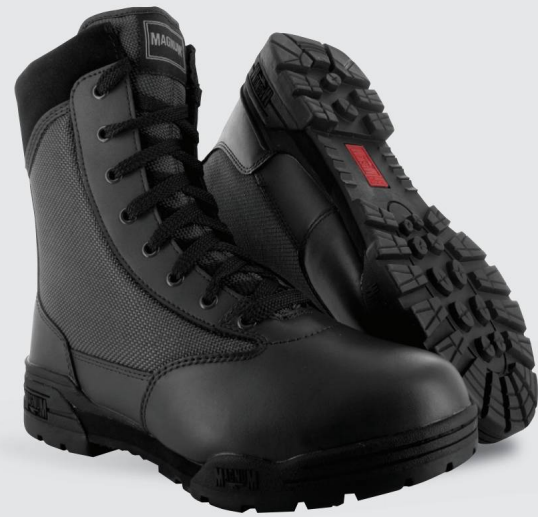
MAGNUM CLASSIC BLACK