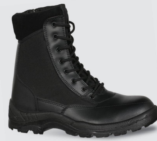
ULINDA SECURITY BOOT

YKK BREATHABLE SHOCK SIDE ZIPPER MATERIAL ABSORPTION RESISTANT