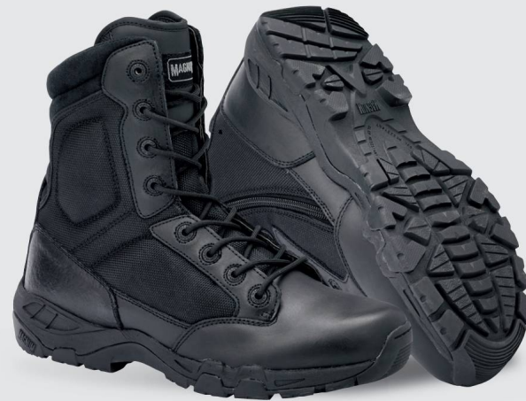
VIPER PRO 8" SZ CT WIDE