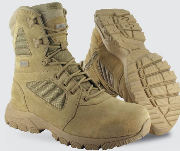
LYNX 8.0 SZ

YKK BREATHABLE SHOCK SIDE ZIPPER MATERIAL ABSORPTION RESISTANT