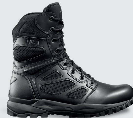
ELITE SPIDER X 8.0

SIDE ZIPPER ANTI-STATIC BREATHABLE WIDE WIDTHS MATERIAL